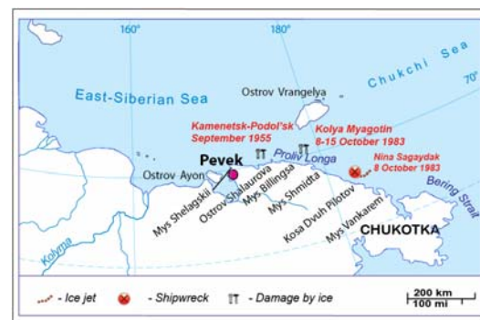
Figure 2. Location of accidents