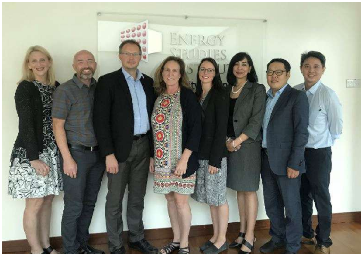
Arctic participants with the Singapore co-convenor.