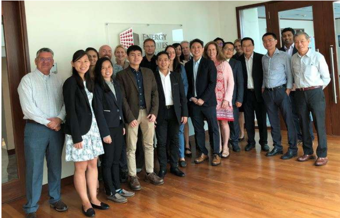
Participants of the AREA Project Singapore Workshop.