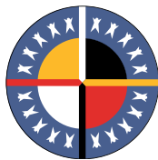
Arctic Athabaskan Council