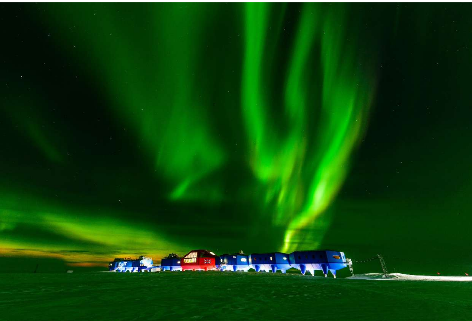
BAS - Halley VI Research Station