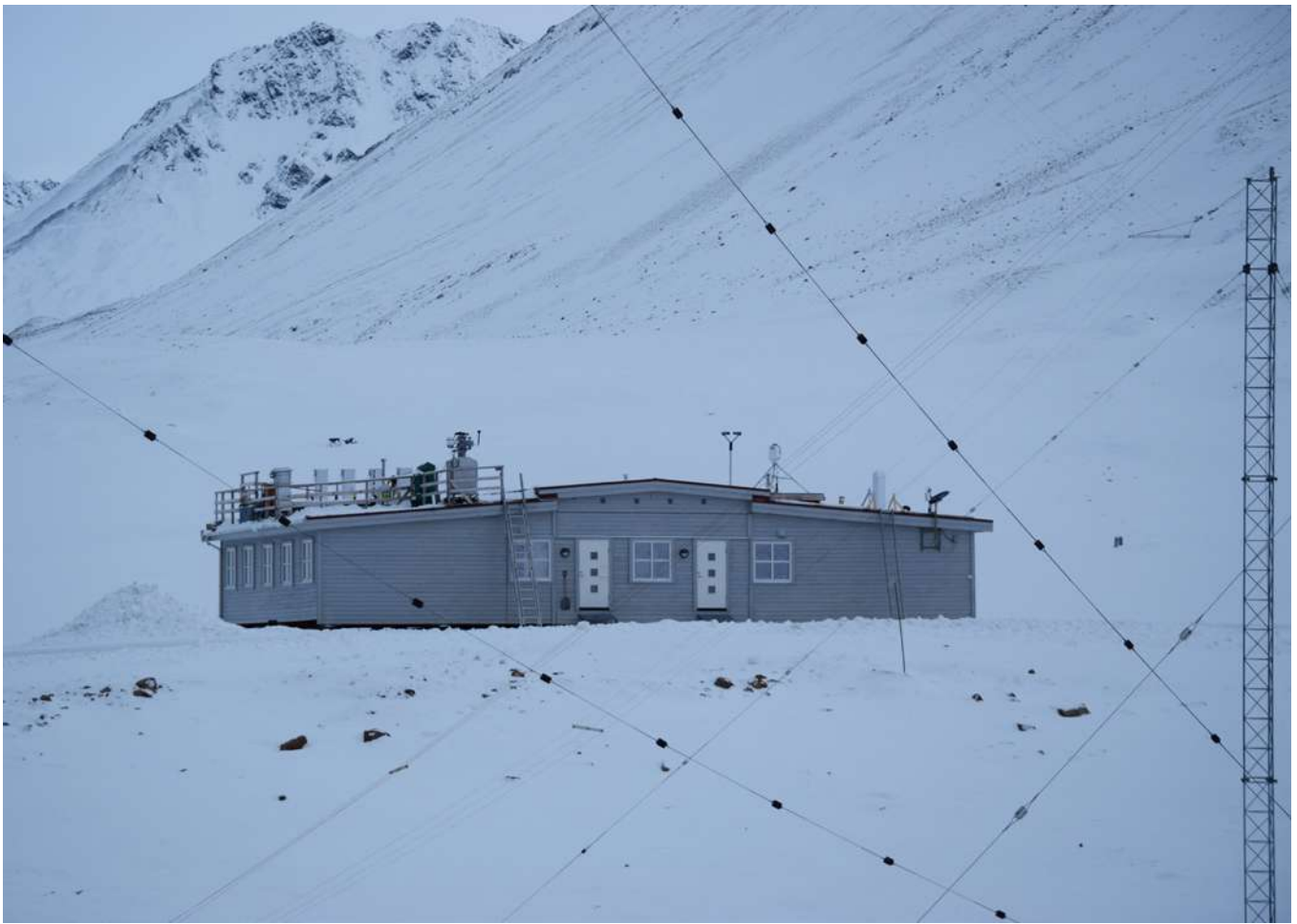
The Gruvebadet aerosol lab.

Governmental authorities and research institutions/communities are connected through the PNRA and PRA research programmes. The two programmes also develop research agendas/strategies that are approved by MUR. Italy continues to implement the Madrid protocol into its national law, which should happen soon. As soon as this takes place, the Environmental Ministry (MATTM) will also serve as the governmental authority for research activities in Antarctica.