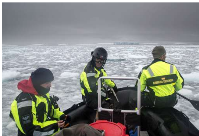
Broken ice by Biscoe Island.

Spain has published Guidelines for a Spanish Polar Strategy . These guidelines were written by SPC and endorsed by the State Secretary of Research. This document has not passed through parliamentary discussions yet.