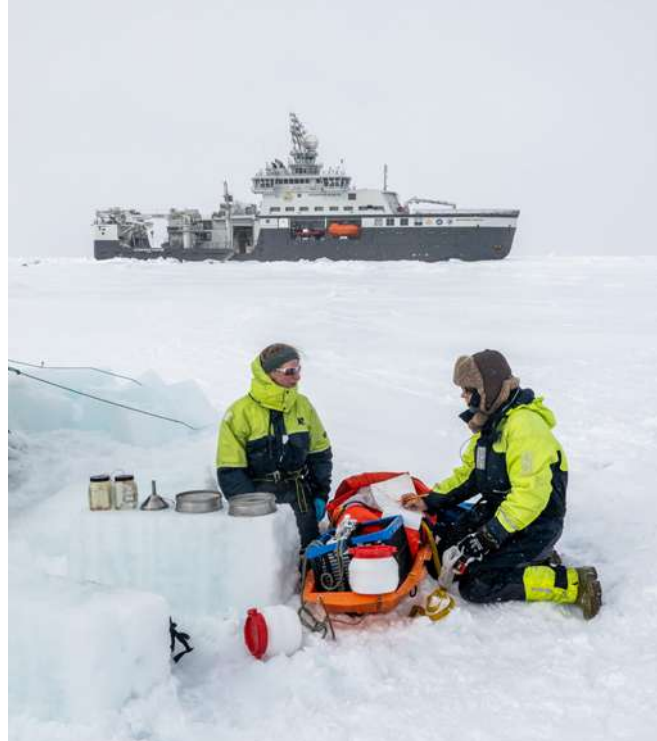
Plastic Cruise Svalbard 2021, Ice stations near Nordaustlandet, where scientists collect samples from the under-ice fauna.

Norwegian membership in the European Space Agency is administered by the Norwegian Space Agency (NOSA) , and NOSA is also the secretariat for the Norwegian participation in the EU's space programme. Several polar orbiting satellites and future satellites under development, i.e., in the EU Copernicus programme, are very important data infrastructures for the polar research community. Facilitating access to reliable and relevant data sources for climate and environmental policies is therefore a priority task for the Government's investments in space activities, The Government's strategy for Norwegian space activities .