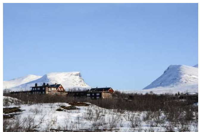
Abisko Scientific Research Station.

The Ministry of Enterprise and Innovation is the Swedish representative in the BEAC working group on economic cooperation (WGEC) and governs the Swedish Maritime Administration. It is the owner of IB Oden. Within the Barents Euro-Arctic region (BEAR) the County Administrative Board of Norrbotten and Västerbotten is active.