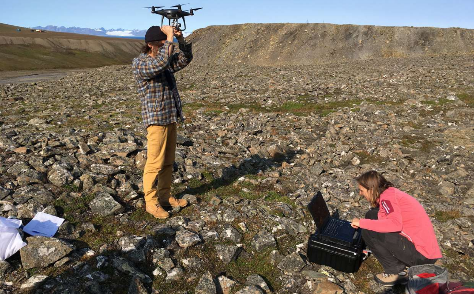
Vegetation drone mapping, Bjørdalen Valley, Adventfjord (Svalbard).