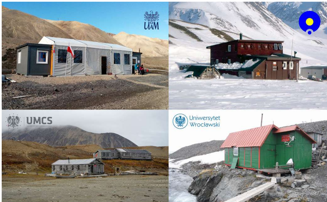
Polish seasonal field stations in Svalbard operated by Adam Mickiewicz University in Poznań, Nicolaus Copernicus University in Toruń, Marie Curie-Skłodowska University in Lublin and University of Wrocław.