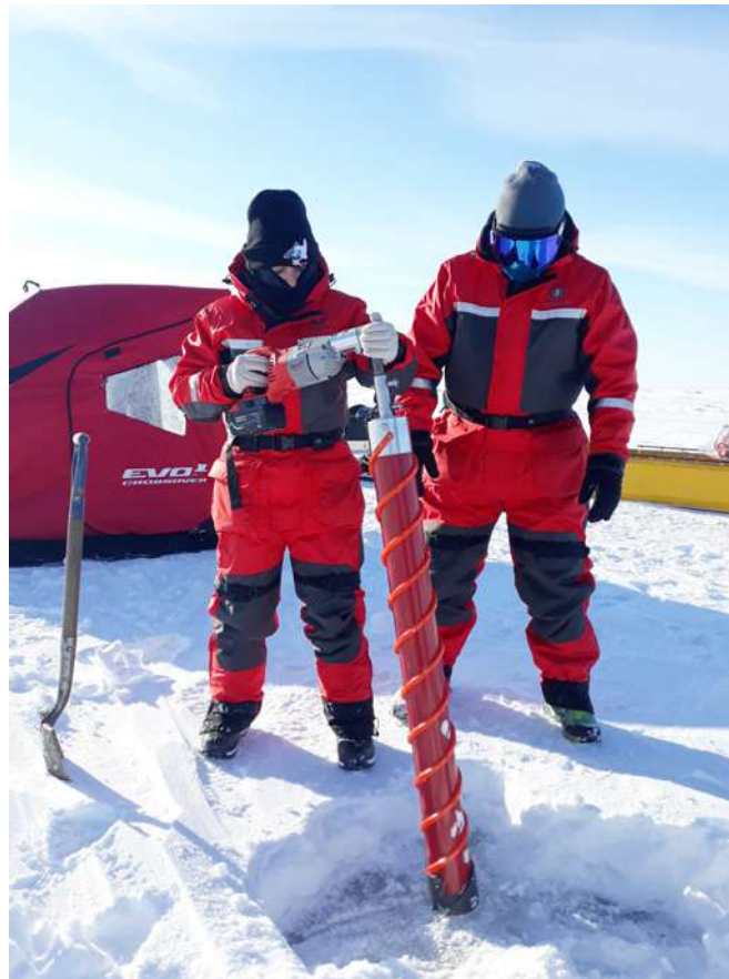
Arctic Activities Portugal.

Portugal has currently no research stations in the polar regions and hence, international collaboration in logistics is essential to its field activities, especially in the Antarctic. Since the start of the Portuguese Polar Programme, Spain is the main collaboration partner providing support with transport of equipment from Europe, as well as cooperation with transport and accommodation of scientists to the Spanish Antarctic stations. This collaboration is framed by a bilateral scientific agreement signed in 2009. Through the FCT, Portugal maintains also scientific and/or logistical cooperation for several years with many institutes and national programmes from South America (Brazil, Argentina, Chile, Uruguay and Peru), Europe (UK, Italy, Spain, Turkey), Asia (China, South-Korea) and the US. Several of these collaborations are sustained by Memoranda of Understanding. Support is provided for the transport of Portuguese researchers and equipment to and from Antarctica, as well as for the use of Antarctic research stations, remote field camps, vessels or for maintenance of field equipment.