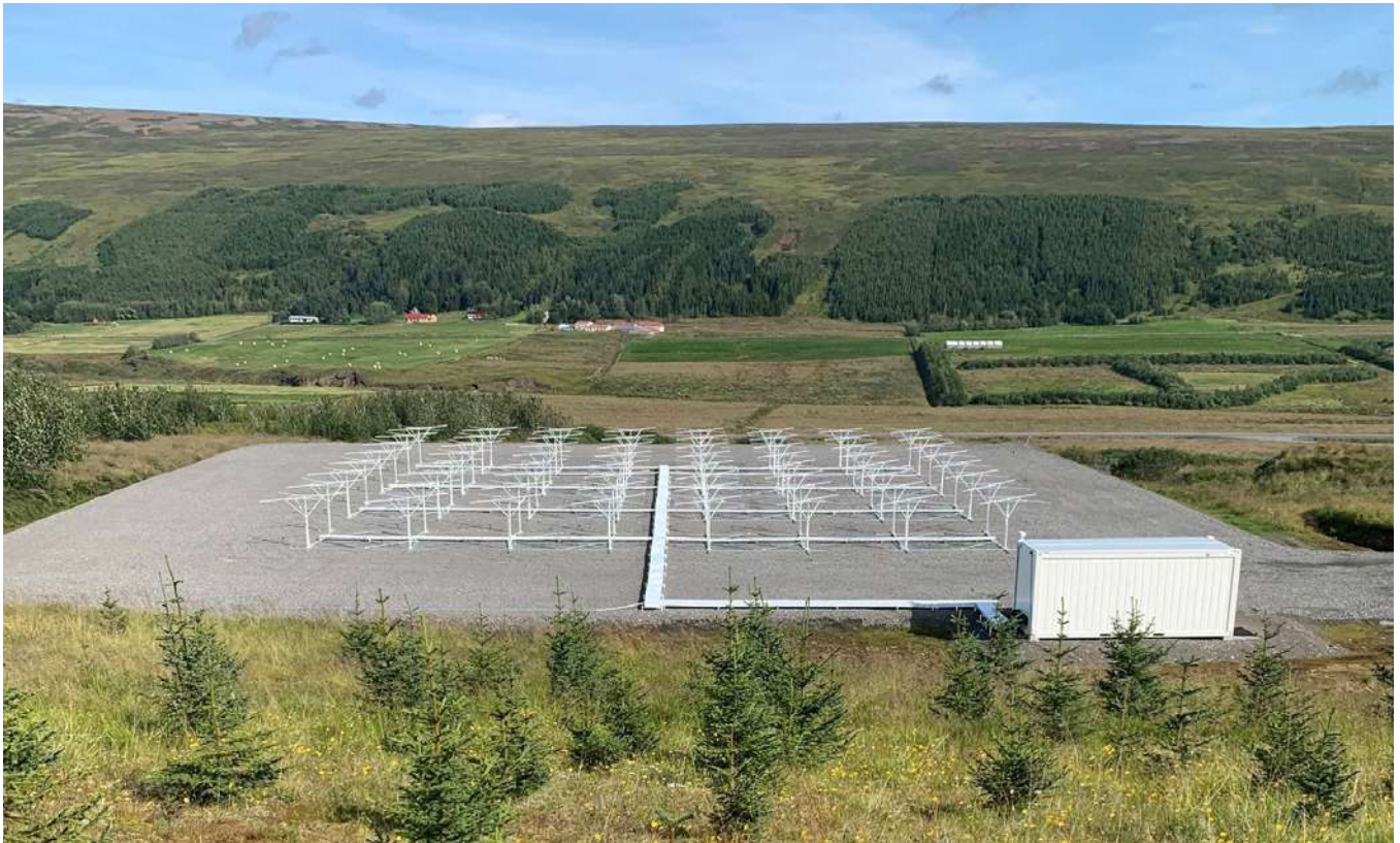
Riometer field, China Iceland Arctic Science Observatory Karhöll 2021.

The Ministry for the Environment, Energy and Climate supervises various affairs pertaining to Arctic research related aspects, including climate change, weather forecasting, and environmental monitoring and surveillance. The Minister for the Environment, Energy and Climate appoints a Cooperation Committee on Arctic Affairs for a four-year period with representatives from eleven public institutes, agencies, and universities. The role of the committee is to strengthen cooperation between the parties concerned through monitoring and research in the Arctic.