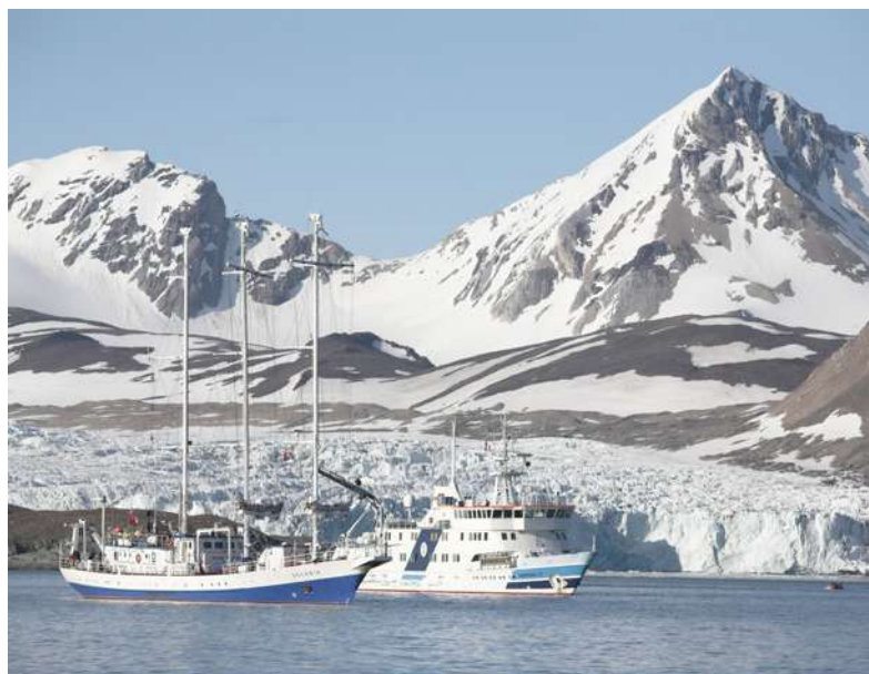
Ocenia, Horyzont.

On January 28th 2022, the Prime Minister decree established the governmental Committee for the National Polar Policy to implement a national polar strategy: The Polar Policy of Poland: Resolution of the Council of the Ministers Republic of Poland No. 129/2020 with the attachment: "Od ekspedycji z przeszłości ku wyzwaniom przyszłości. Polska polityka polarna" [From expeditions from the past towards challenges in the future. The polar policy of Poland - in Polish]. This first governmental strategy on policy related to the polar regions is mainly based on the "Strategy for Polish Polar Research - a concept for the years