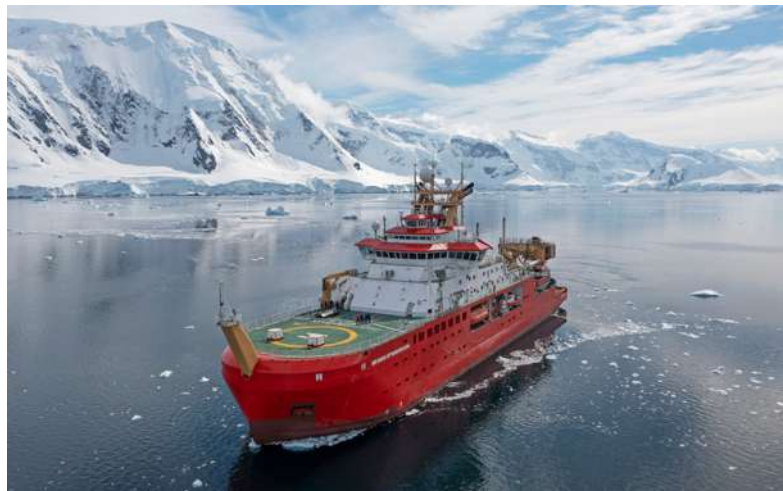
The United Kingdom's polar research vessel, RRS Sir David Attenborough, in the Neumayer Channel, Antarctica, January 2022.

Detailed information on the infrastructures can be found in Polardex .