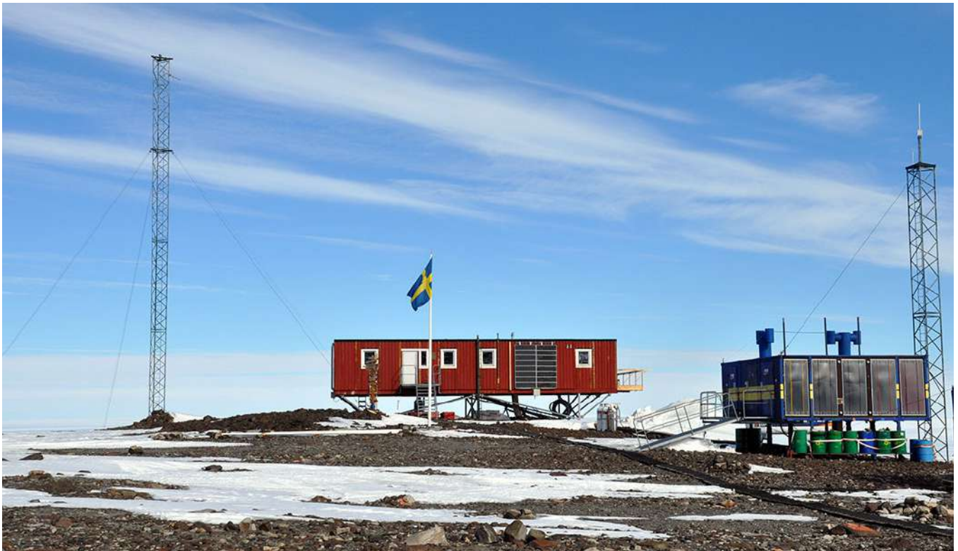
The research station Wasa in Dronning Maud Land, Antarctica.