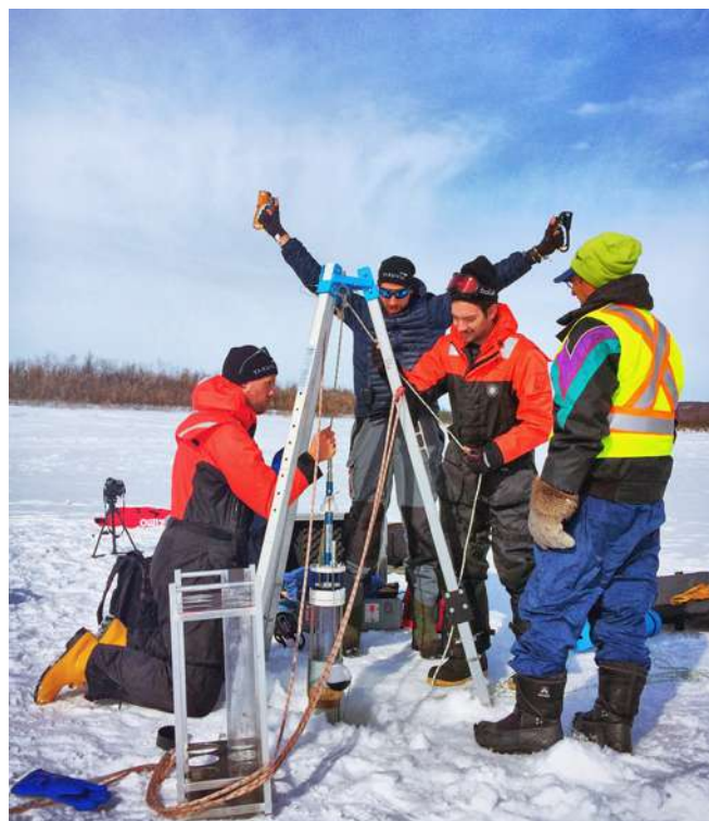
Iles Kerguelen, Lac Athena, 2019: deploying instrumentation near lake Athena as part of PALAS project. Lake sediment archives are used to reconstruct the history and ecological impact of rabbit invasion since their introduction on the island in 1874.

GROUND TRAVERSES are established between the Antarctic coast and Concordia station for resupply of the station together with the Italian ENEA operator (3 traverses each summer). The French-Italian coastal station Robert Guillard, located 5 km from Dumont d'Urville, serves as a hub to prepare the logistic convoys and scientific traverses deployed on the East Antarctic Plateau.