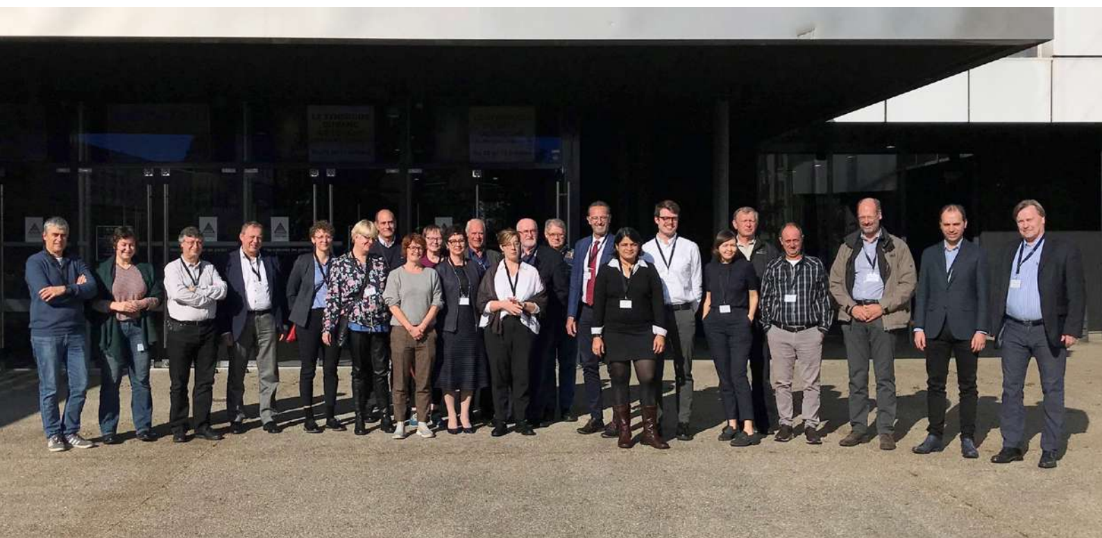
EPB Autumn 2019 Plenary Meeting, Brest.

ican polar programmes (via the Reunión de Administradores de Programas Antárticos Latinoamericanos (RAPAL)). The EPB actively works (with EU-PolarNet 2), towards implementation of the All-Atlantic Ocean Research Alliance goals for the polar regions. Within the INTERACT III project, the EPB leads work to understand the impact of the Agreement on Enhancing International Arctic Scientific Cooperation on researchers and station management throughout the Arctic.