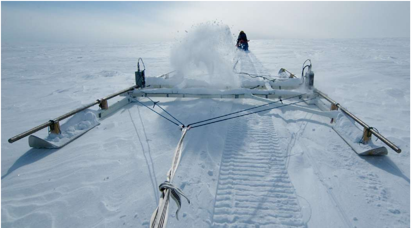
Greenland Zackenberg.