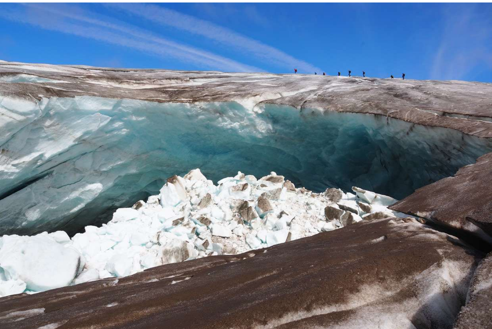
Greenland Mittivakkat c Glacier.