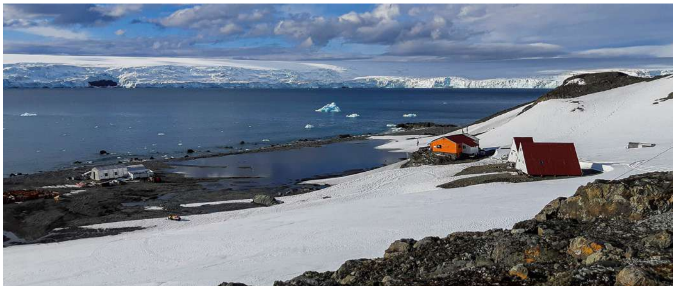
Bulgarian Antarctic base St Kliment Ohridski.

tific excellence and logistical feasibility including all necessary permissions. All foreign participants are responsible for their own transportation to and from a hub city in South America, their insurance and stay while outside Antarctica.