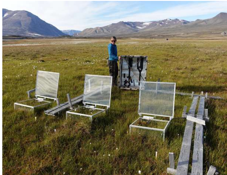
Zackenberg 2.