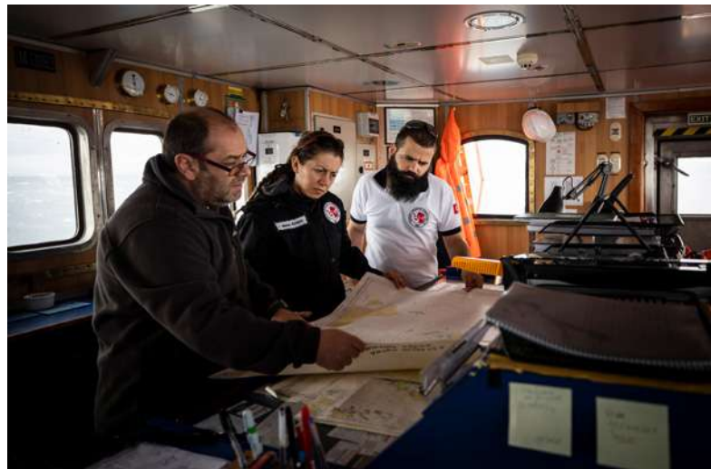
2018-2019 Antarctic Season, R/V Betanzos.

The Ministry of Industry and Technology prepared a National Polar Science Programme for the 2018-2022 period with contributions from over 100 scientists from 40 institutions. The objective of the programme is to implement polar research with a systematic approach. The vision of the programme is "becoming one of the scientifically-successful programmes". As required by this vision, the main objectives are implementing polar research activities with a systematic integrity and project approach, ensuring that national expeditions are conducted to polar regions to provide scientific opportunity, promoting bilateral cooperation on polar sciences and creating awareness of global climate change and polar regions.