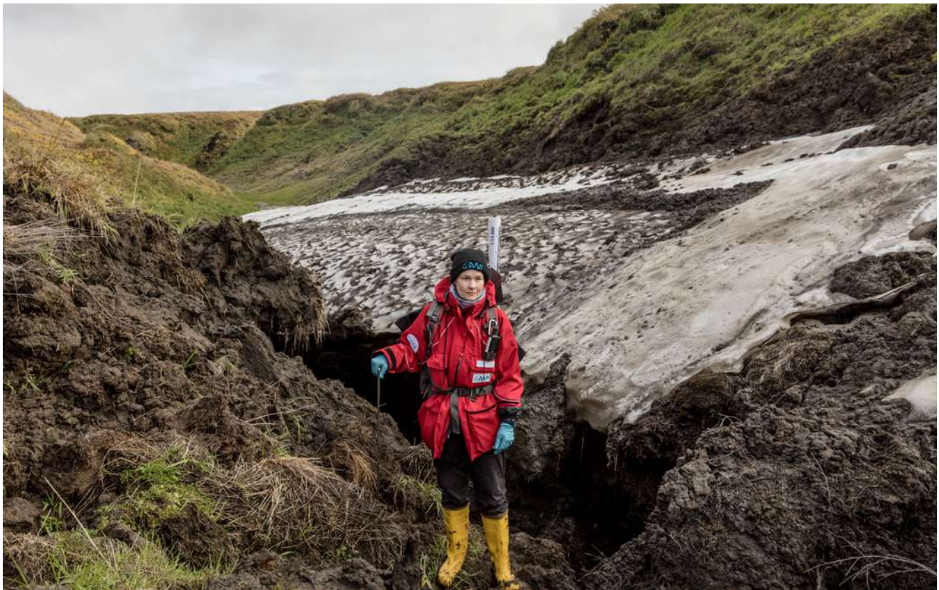
Permafrost research on Samoylov.

various observatories that gather data over longer timeframes. One example is the FRAM observatory in the Fram Strait, which targets a modern vision of integrated underwater infrastructure. FRAM enables truly year-round observations from surface to depth in the remote and harsh Arctic Ocean.