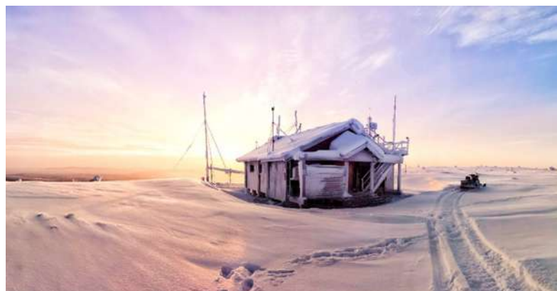
Pallas Atmosphere-Ecosystem Supersite, Pallas Global Atmosphere Watch station, Finnish Meteorological Institute.